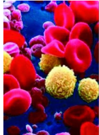
Adult stem cells in the bloodstream

For those of us just wanting to maintain optimal health or address the effects of aging, injury, or day to day wear and tear, a smaller but steady release of our existing stem cells into the bloodstream can produce considerable health benefits. When StemEnhance™ is used as a daily supplement over time, the stimulation of billions of additional stem cells in the bloodstream could be one of the safest and most efficient methods for maintaining optimal health that science has yet discovered.