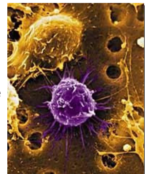
Adult stem cell in bone marrow

Adult stem cells are predominantly formed in the bone marrow. And, just as in the beginnings of life, adult stem cells can literally change into any type of cell in the body throughout life. These adult stem cells are released from the bone marrow into the circulation of the bloodstream to seek out problem areas, then renew and restore those areas.